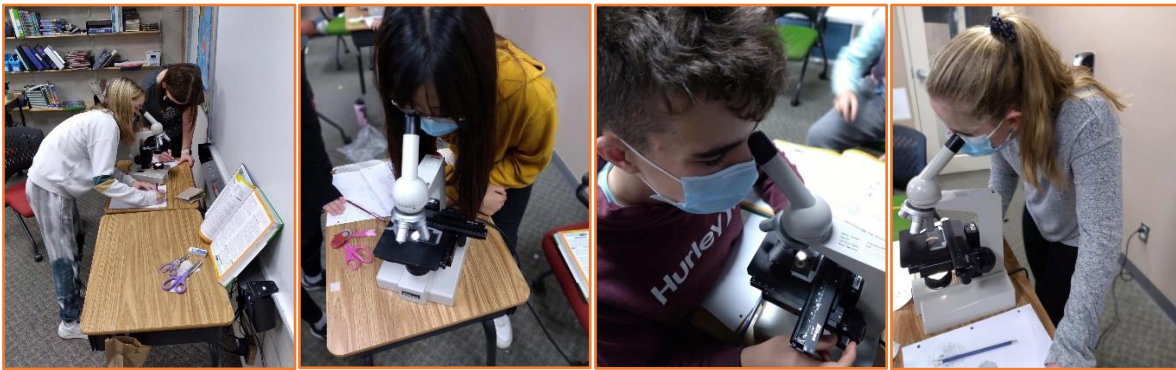
Grade 8 class looking at cells using a microscope

Academic Excellence and Godly Instruction