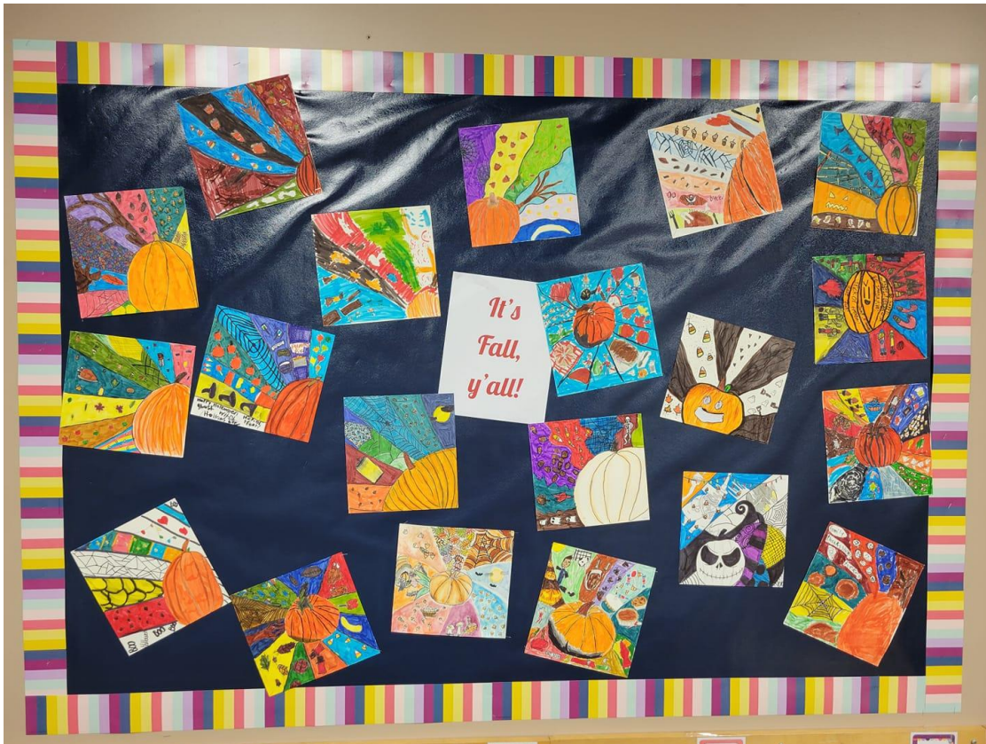
In Grade 5, "it's fall, y'all!" Colorful art representing things they love about Fall!