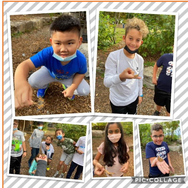
Grade 4 --- observed the process of caterpillars becoming butterflies.