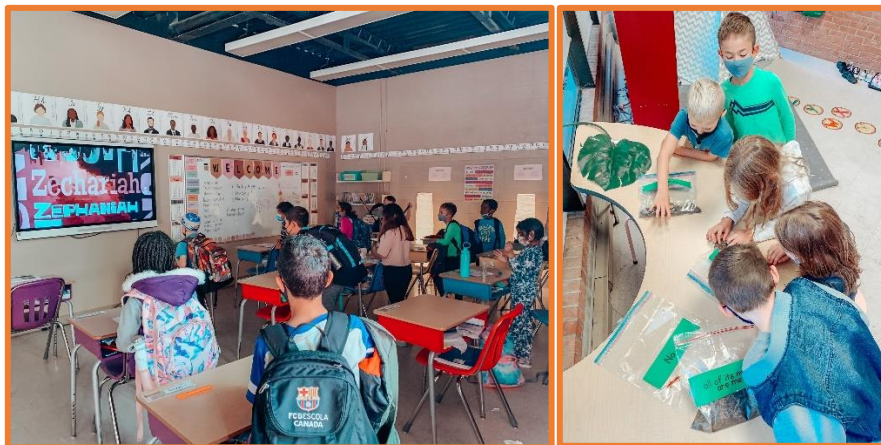
Closing off the day practicing our Books of the Bible Song. Checking out our bean plant experiments!

Academic Excellence and Godly Instruction