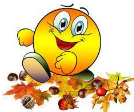
Grade 2 class chapel time.