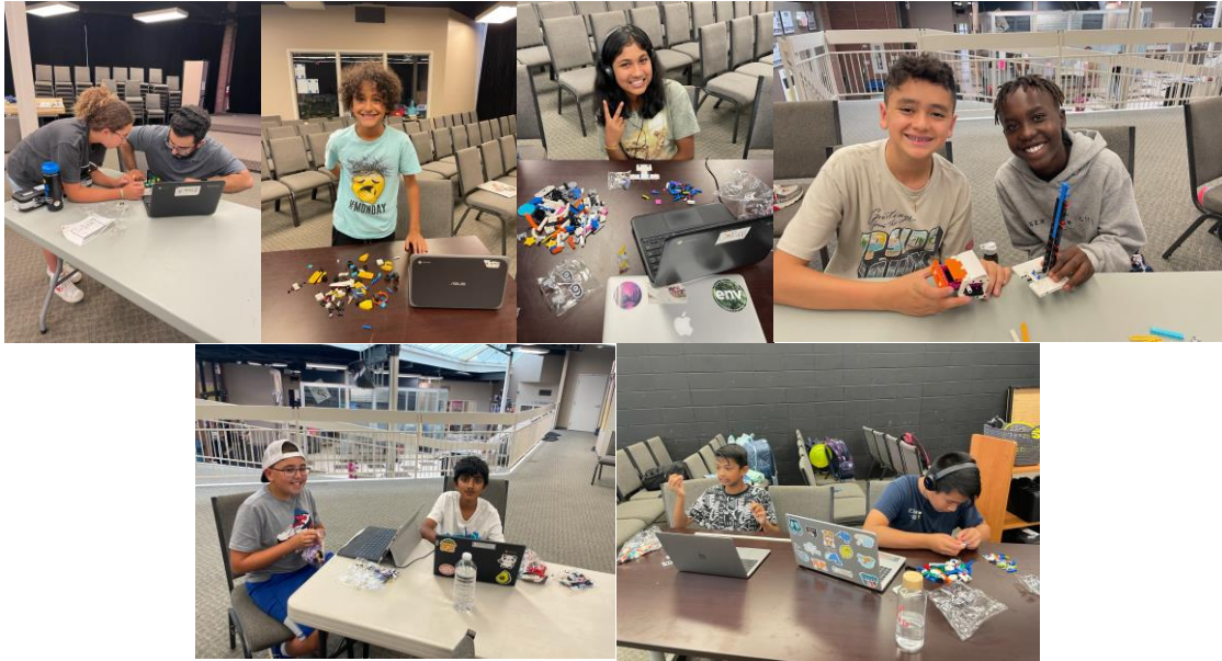
MCS robotics team.