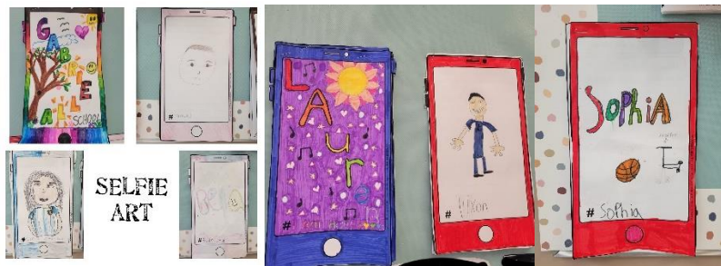
Grade 5 Selfie Art