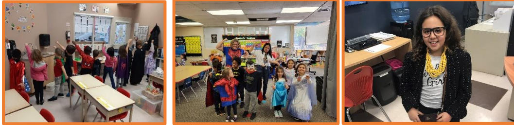
Superhero Day @ MCS – Grade 1, Kindergarten, and student dressed as Mom!