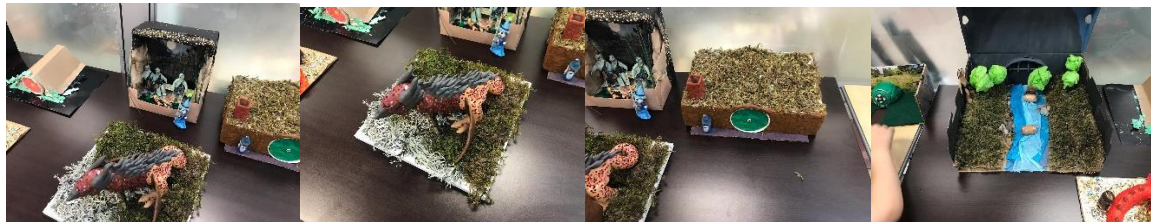
Grade 8 class had their celebration of learning for their Hobbit projects