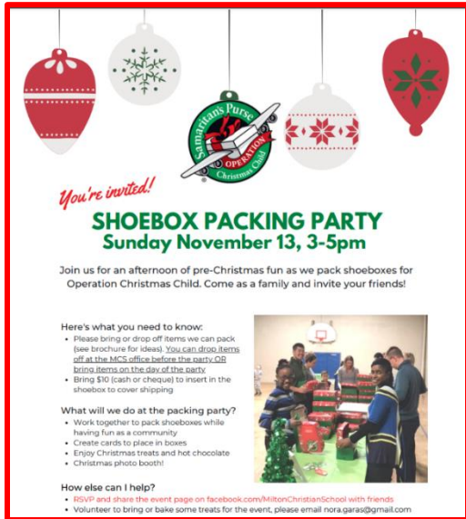
Operation Christmas Child - Packing Party: Drop off supplies in the lobby/office.