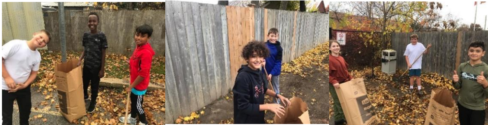
Grade 6 yard work