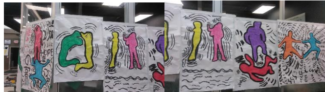
Grade 3 Art Work

Academic Excellence and Godly Instruction