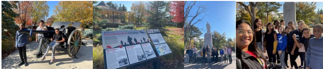
As Grade 7 prepares for Remembrance Day, we took a walk to Victoria Park to see the Commemorative Cenotaph. We saw the names of people from Milton who are remembered for their sacrifices.