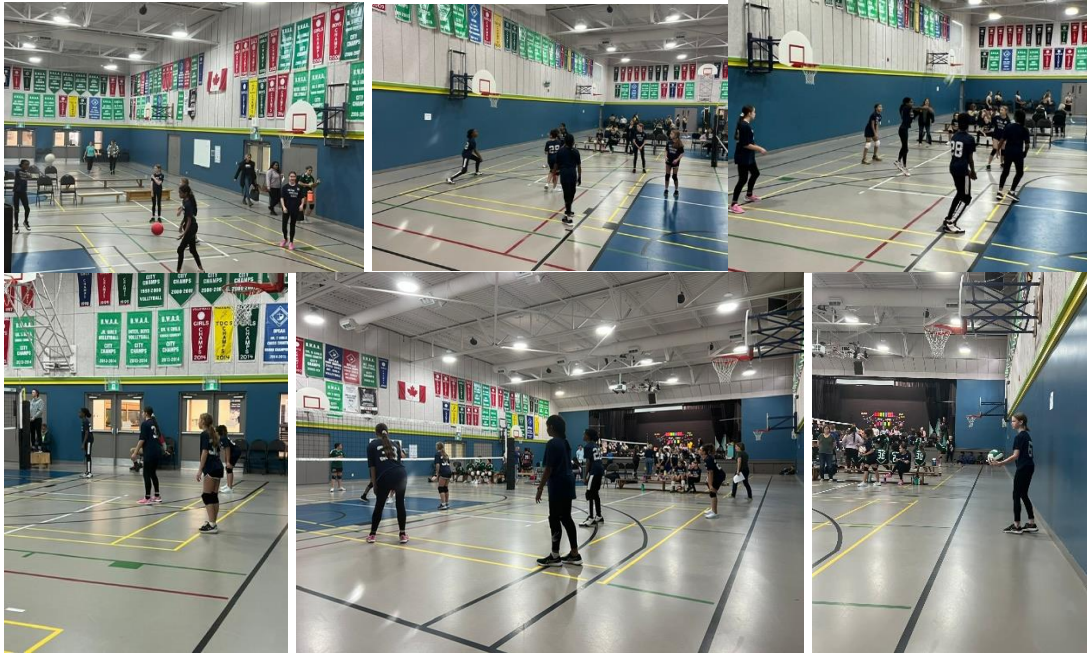
Girls Volleyball tournament @ John Knox Christian School, Brampton.