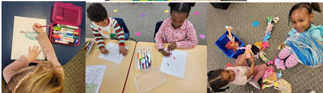
Free play in kindergarten - craft, build & make believe!