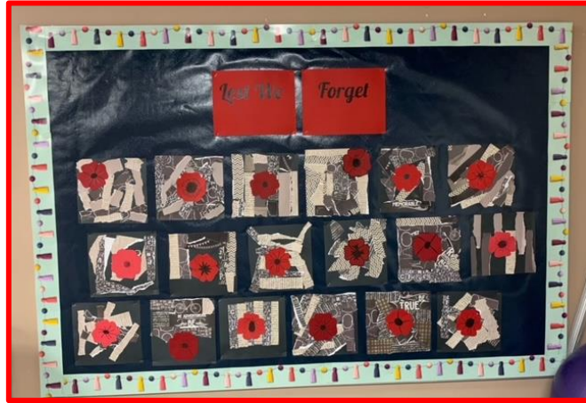
Grade 5 - Remembrance Day Art