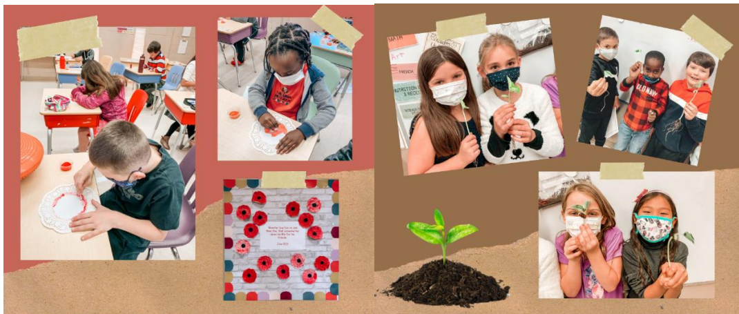
Grade 3- Making dot-art poppies and writing about the importance of Remembrance Day & The result of our bean plants!