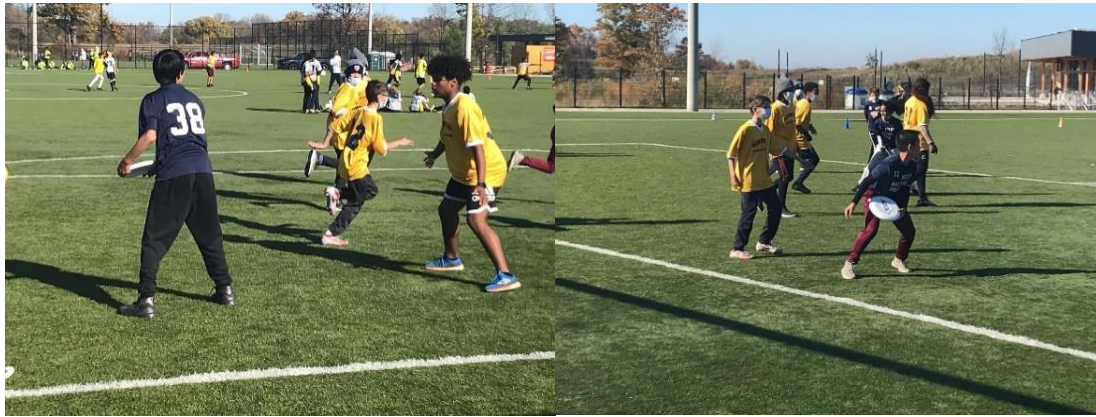
Ultimate Frisbee tournament @ City View Park, Burlington.