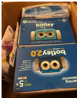
Fun robots coming to kindergarten! #STEM