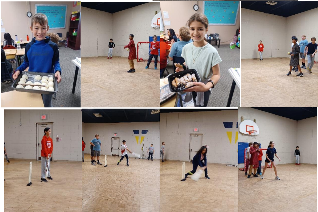
Grade 6 class presentation and activities

Academic Excellence and Godly Instruction