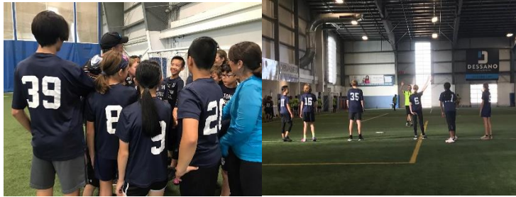
Student athletes participated in the Ultimate Frisbee tournament in Oakville soccer club.