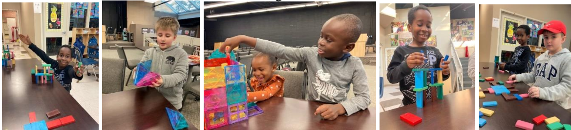
After-school care activities

Academic Excellence and Godly Instruction