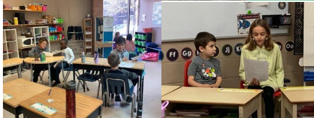
Grade 5 sharing their personal narratives with the Grade ones who recently finished a similar writing assignment.