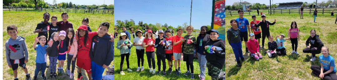
TRACK AND FIELD DAY 2023