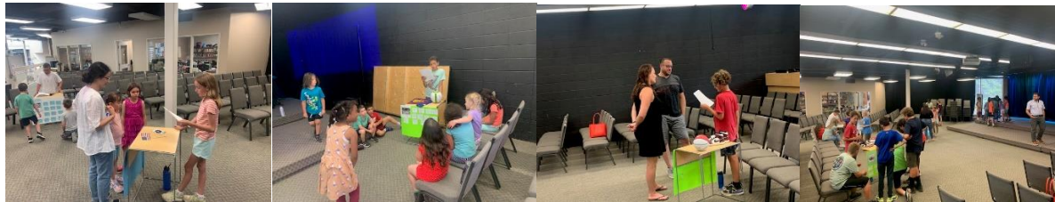
Grade 5 students shared their biography projects with family members and students at MCS this past week.