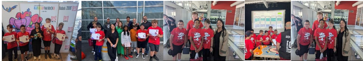
MCS Robotics team with their coach and families @ Montreal on June 3