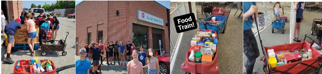
Food drive delivery at the Salvation Army by Grade 6. Thank you all for your generous donations.