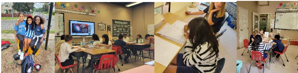
Grade 4...friends hanging out and class project.