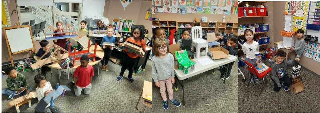
Grade 1 Structures Building Project - CHAIRS