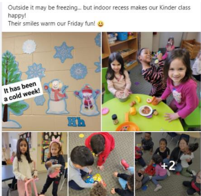
Indoor recess in Kindergarten class on a cold day!!!

Academic Excellence and Godly Instruction