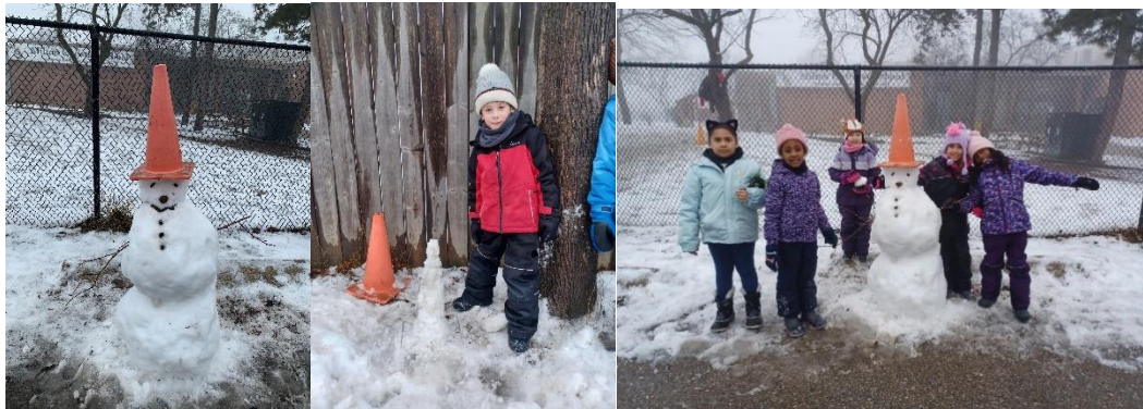
Out and about in the snow at recess! Hey Snowman!