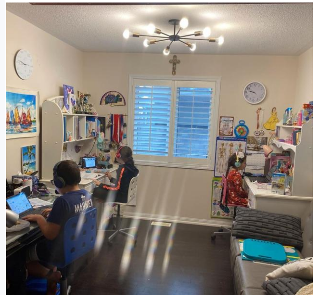
Homeschool work station