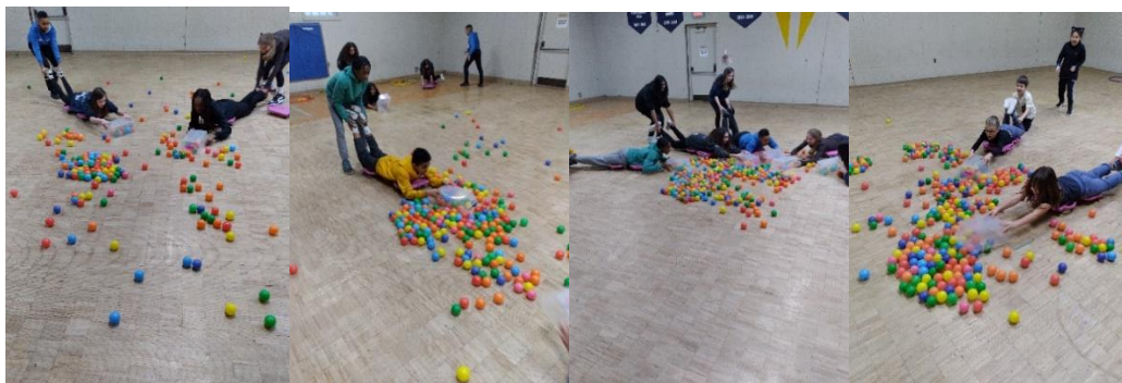
Playing 'Hungry Hippo' in Grade 2 and 8 phys. ed.

MCS is holding our first SKIP-A-THON on Thursday February 29 th ! We are looking for community business partners to sponsor each class for 30 minutes of skipping. As a school we will skip for 5 hours! If you have a business or work for a local business who might like to partner with us in this healthy activity event, please reach out to community@miltonchristianschool.com for a digital sponsorship letter with more information!