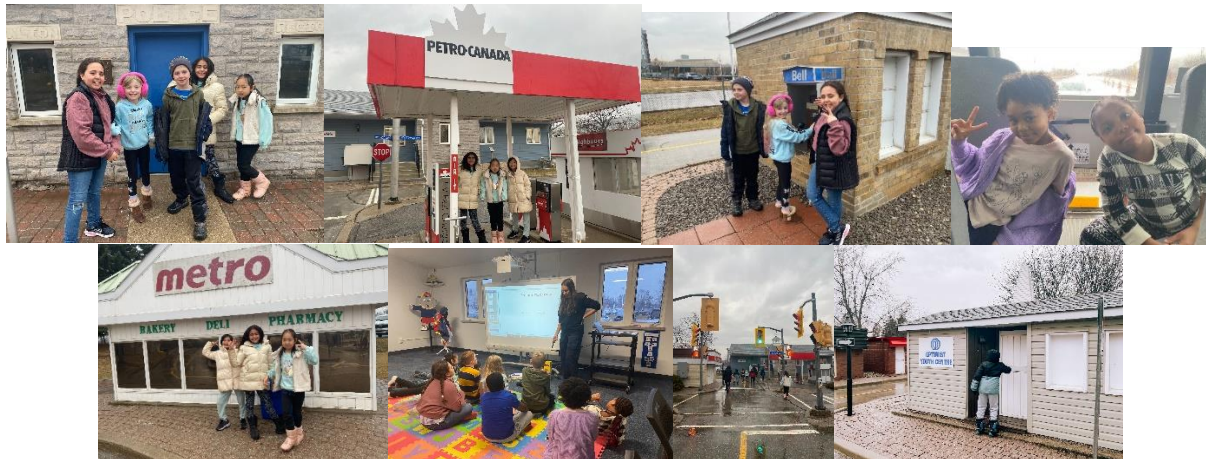
Grade 3 trip to Halton Children’s Safety Village!