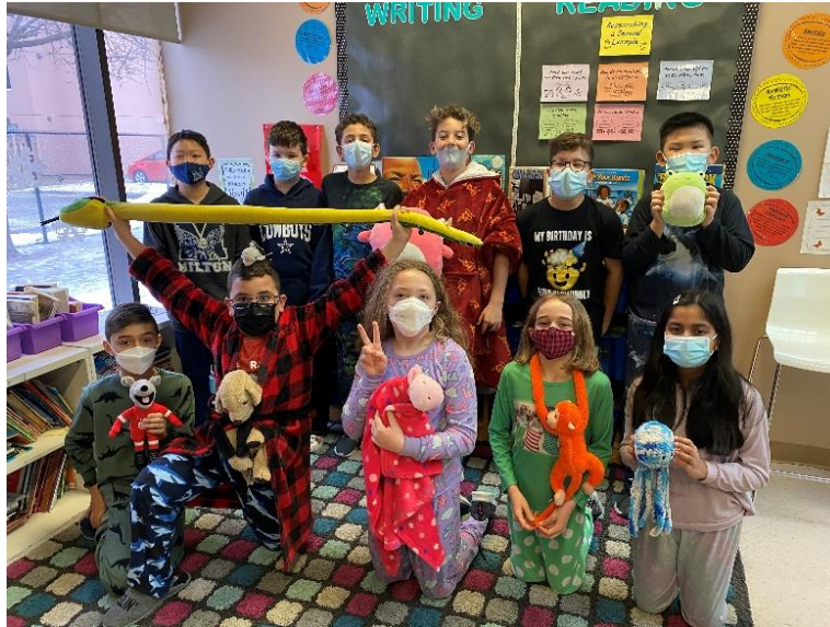
Grade 4 Class - Pajama Day