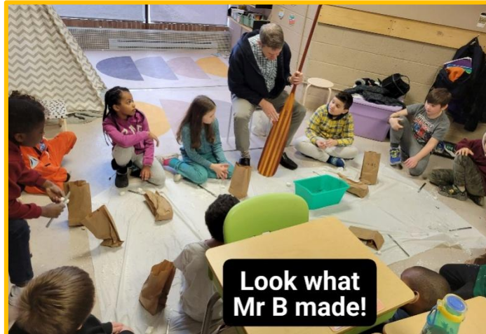
Grade 3 Art class