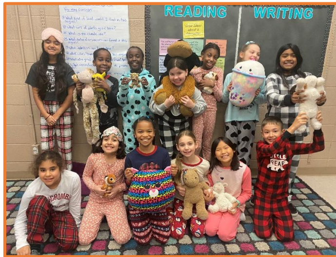
Grade 4 PJ Day