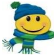
Kindergarten Valentine's Day