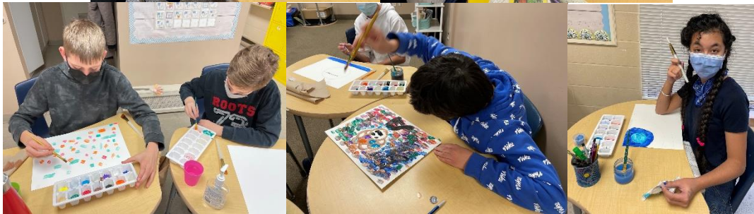
Grade 7 class..... Hard at work!

Academic Excellence and Godly Instruction