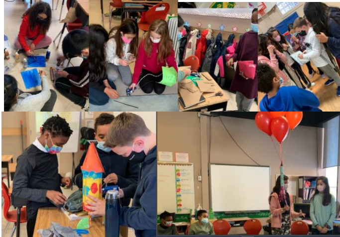
Grade 6 class activity