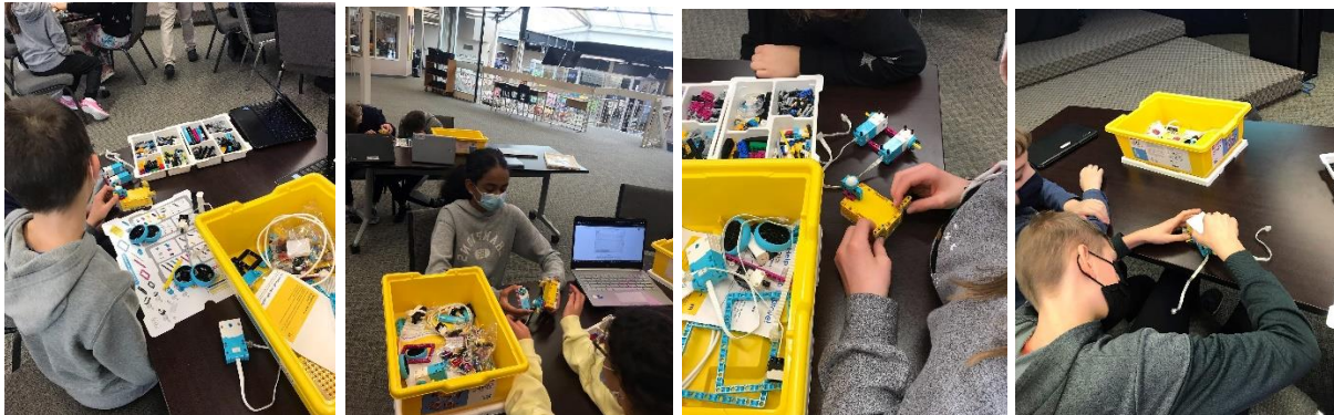
Grade 7 class building robots.

Academic Excellence and Godly Instruction