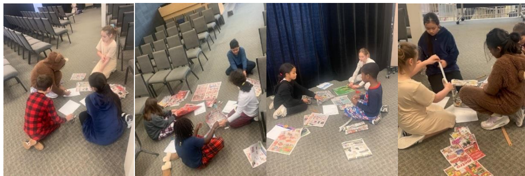
Grade 5 was challenged in science class with building a tower made of only newspaper and masking tape in only 25 minutes!!