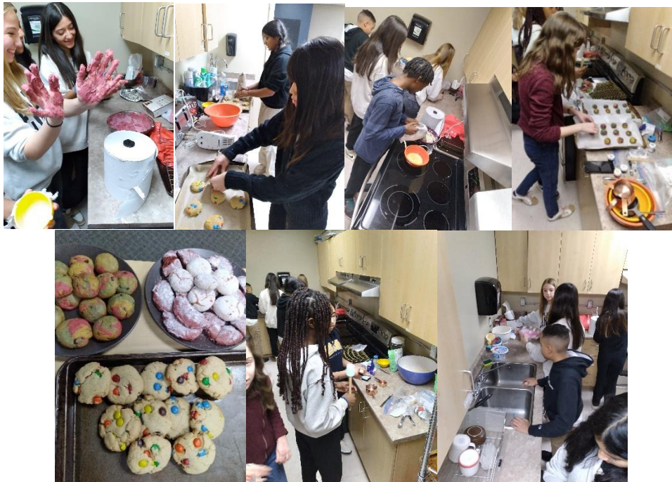
Grade 8 lessons in chemistry and proportions.

Academic Excellence and Godly Instruction