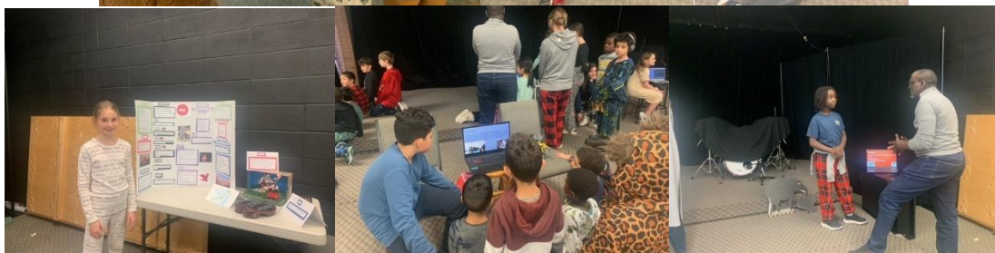
Grade 5 shared their nonfiction reading projects with the MCS community last week.