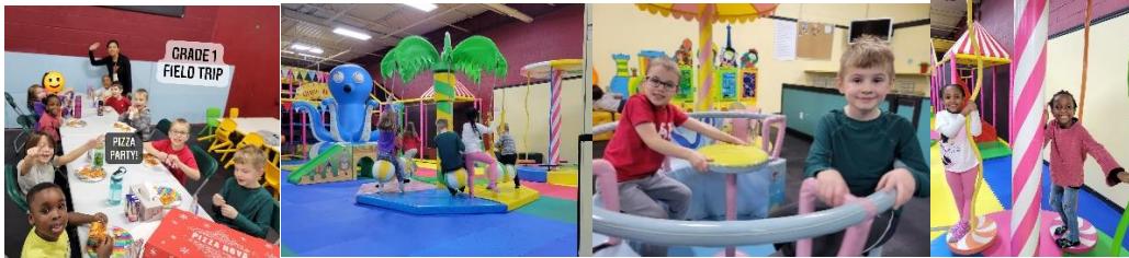
Grade 1s enjoyed a class party/field trip at Cirque du Play, Milton