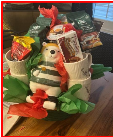
Christmas concert- Door prize (Gift Basket)

Students sure have been busy getting creative at school