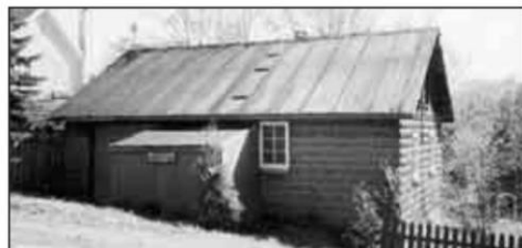
◀ Martin's Blacksmith Shop, 2002