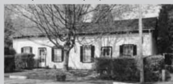
▲ Martin Residence