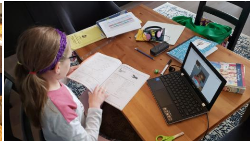
Online learners in action!