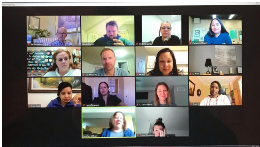
MCS Staff getting ready for online learning!