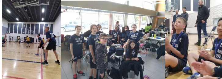
Badminton Tournament Team