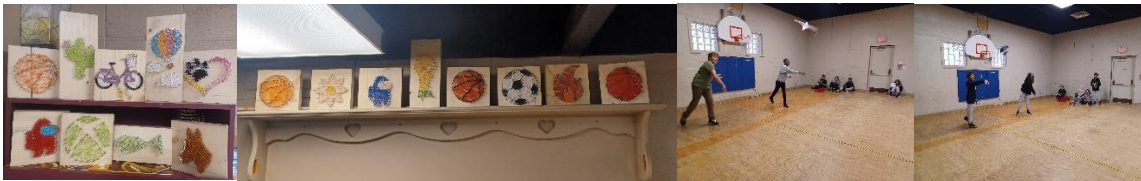
Grade 6 String Art flying airplanes