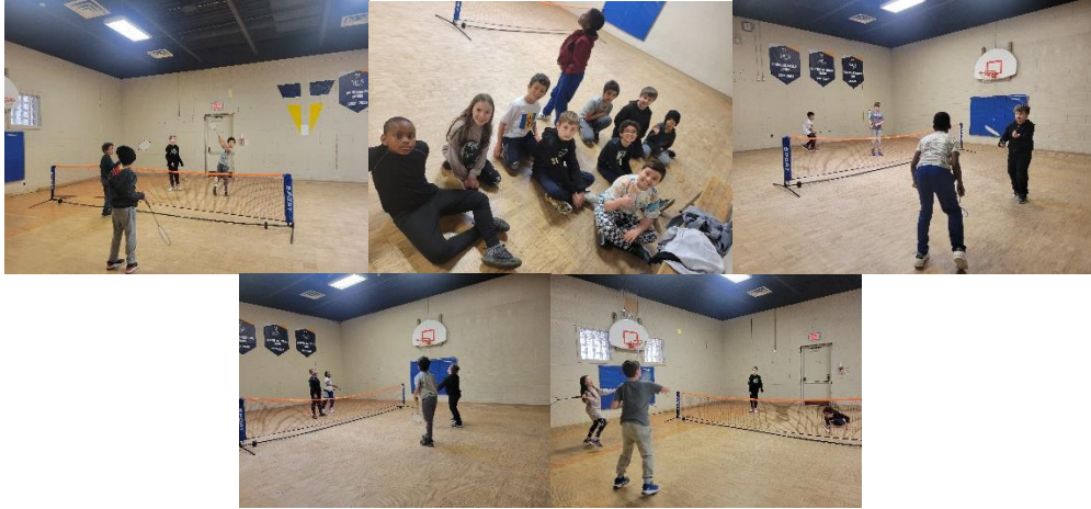
Grade 3 Gym Class