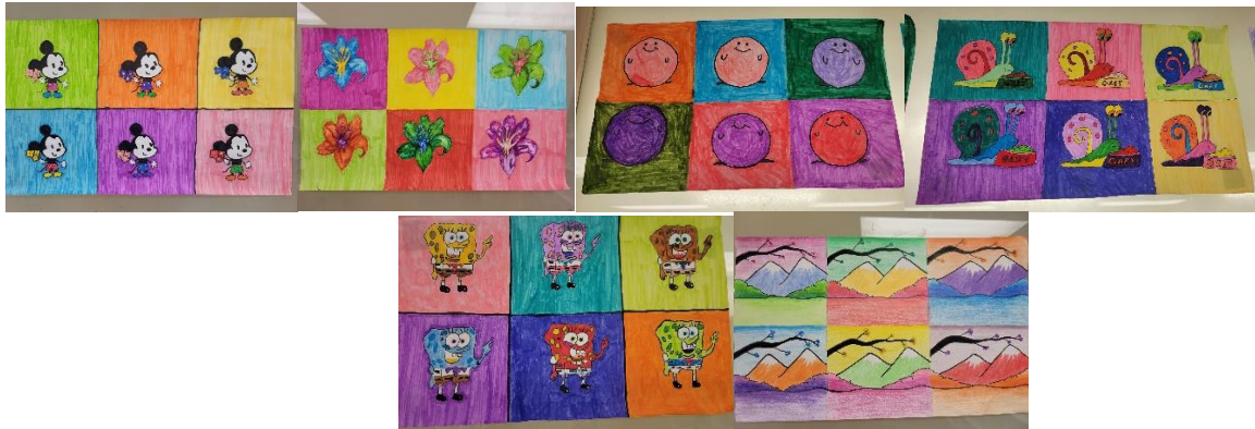
Grade 7 Artwork

Academic Excellence and Godly Instruction