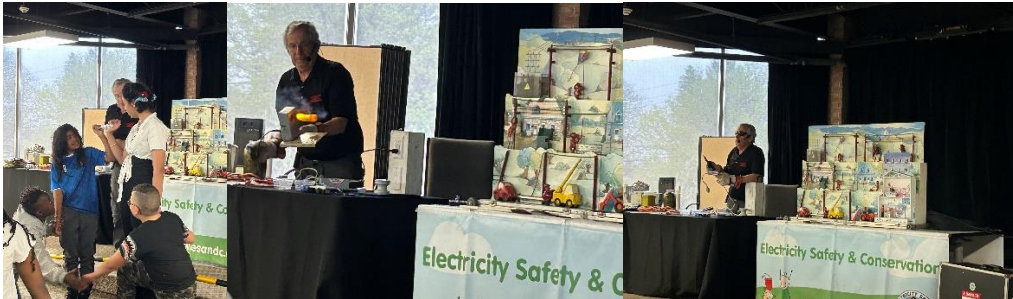
Milton Hydro presentation, Monday April 17