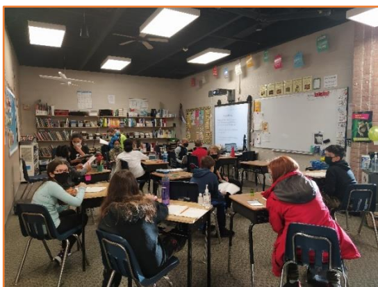
The Grade 6's meet in the morning for a time of advisory with one another. Together we build curiosity, set goals, and establish ways to encourage one another (and much more!). It is a wonderful way to connect and grow together in meaningful ways.