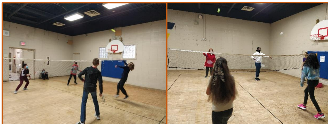
Badminton Time! The Grade 6's developing and performing their Badminton skills.