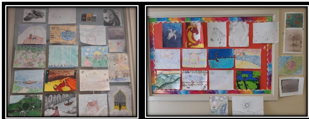
Grade 8 The Hobbit art and pointillism